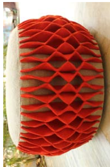
Marigold The Marigold seating collection is inspired from the Marigold flowers from India

The Marigold seating collection is inspired from the marigold flowers from India that are used for rituals and other auspicious occasions for various ceremonies.