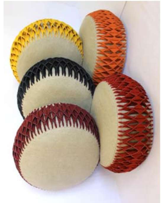
Marigold The petal work of the flowers has been interpreted in the form of origami.