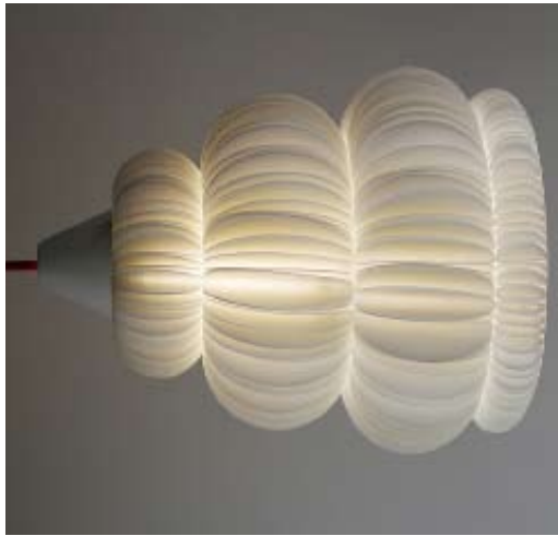
Luna Luna is an ethereal light sculpture dedicated to biomorphism

These products are truly unique; the hand of the artisan is evident in the work, bringing to focus the material finish and irregular facet variations that occur with it.