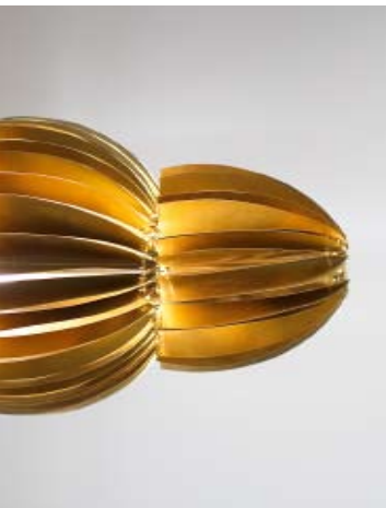
Radia Radia too is a part of the Fin Cloud light series

The lighting collection for me is a perfect blend of parametric designing and Indian handicrafts. All though they are modular, since they are handmade, they are slightly irregular which also imparts them uniqueness and character.